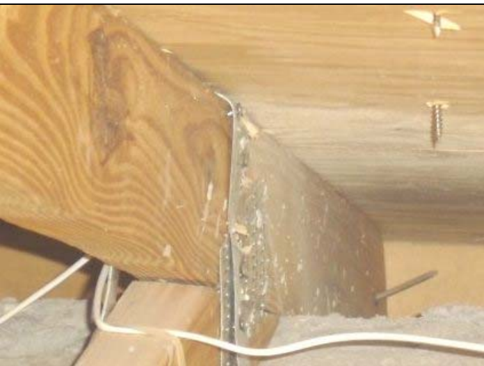
Roof to wall attachment