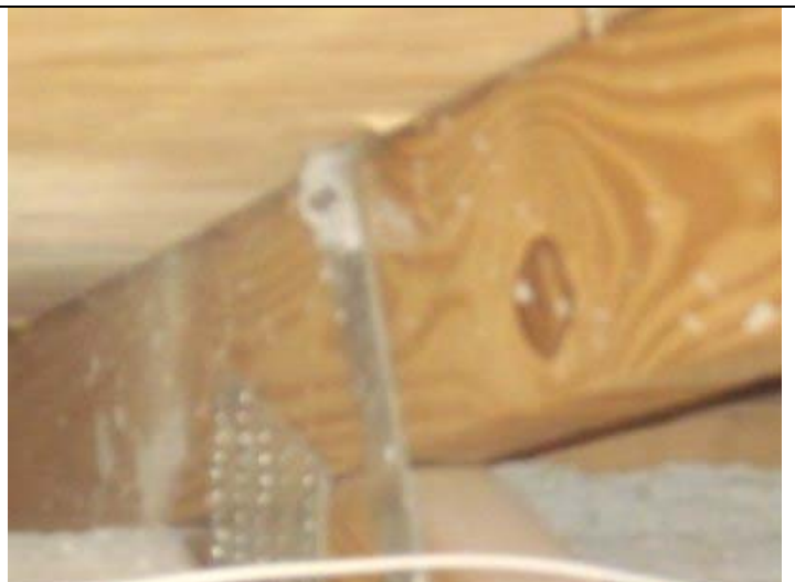
Roof to wall attachment