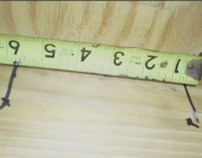
Roof deck attachment