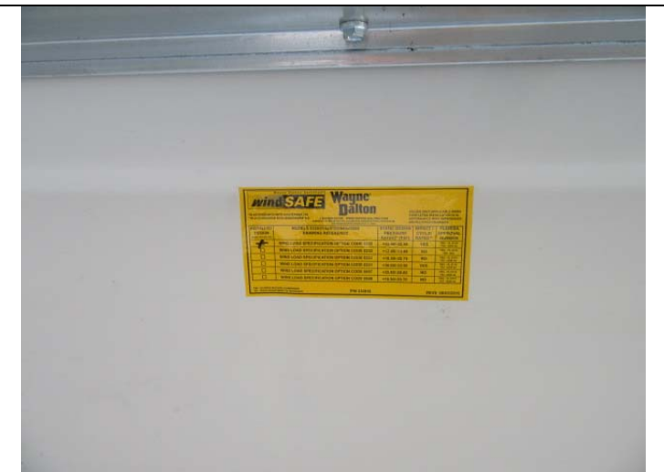
Garage door data